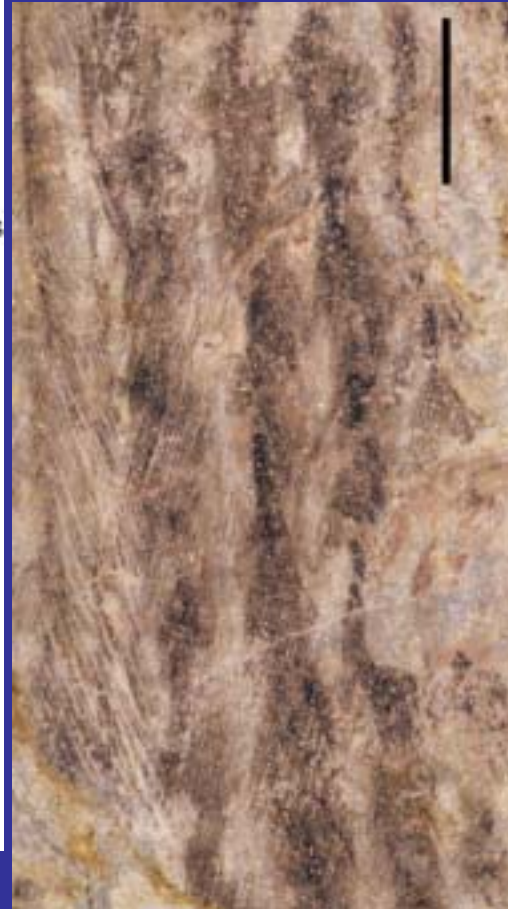
Caudipteryx (a oviraptorosaur)